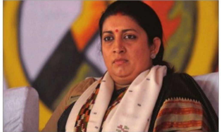
From tackling depression among students to ensuring their grievances are settled in a "student-centric" approach, Union HRD minister Smriti Irani has announced a slew of policies.

According to a press release issued by the National Institute of Technology, Warangal, the Council is the apex policy making body for 31 NITs, five Indian Institutes of Science Education and Research, and the Indian Institute of Engineering, Science and Technology in Shibpur. Asking such elite institutes of learning to adopt a "student-centric approach", Irani emphasised that student grievances should be addressed effectively and in a time-bound manner. She has constituted a grievance cell at the Council level that will monitor complaints and coordinate with directors of these institutions to effectively address grievances. The issue of seats remaining vacant in such institutes of national reckoning was also addressed, with Irani saying, "Common counselling not only reduces stress on students and parents but also minimises vacant seats. Less than two per cent seats remained vacant after five rounds of counselling leading to all-time high numbers of admission in these prestigious institutions." She also expressed the wish that institutes be made into islands of excellence by focusing more on innovation, design and research in specific areas along with a strategy for inter-collaboration.